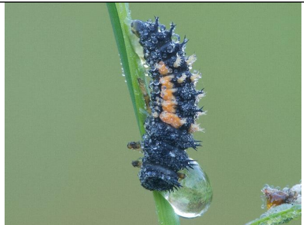
Ladybug larva by Marcel Zurreck