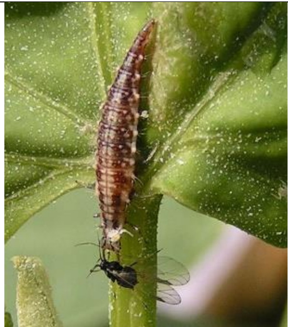
Green Lacewing Larva – also called Aphid Lion (Wikipedia)