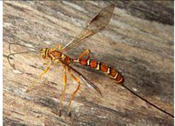
Yellow Ichneumon Wasp (Wikipedia)