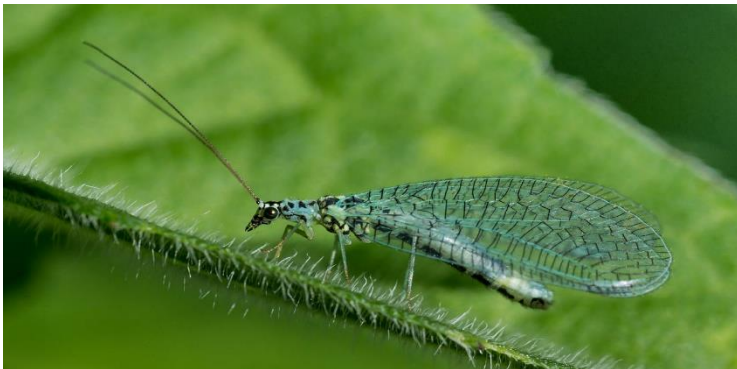
Green Lacewing Adult